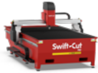
Pro 48 4' x 8' cutting area