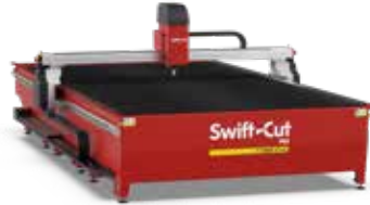
Pro 613 6' x 13' cutting area