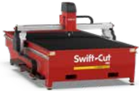
Pro 510 5' x 10' cutting area