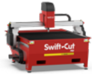
Pro 44 4' x 4' cutting area